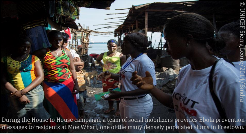
During the House to House campaign, a team of social mobilizers provides Ebola prevention messages to residents at Moe Wharf, one of the many densely populated slums in Freetown.