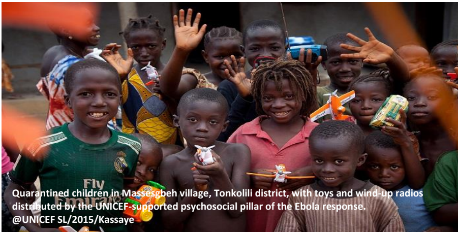
Quarantined children in Massesbeh village, Tonkolili district, with toys and wind-up radios distributed by the UNICEF-supported psychosocial pillar of the Ebola response.