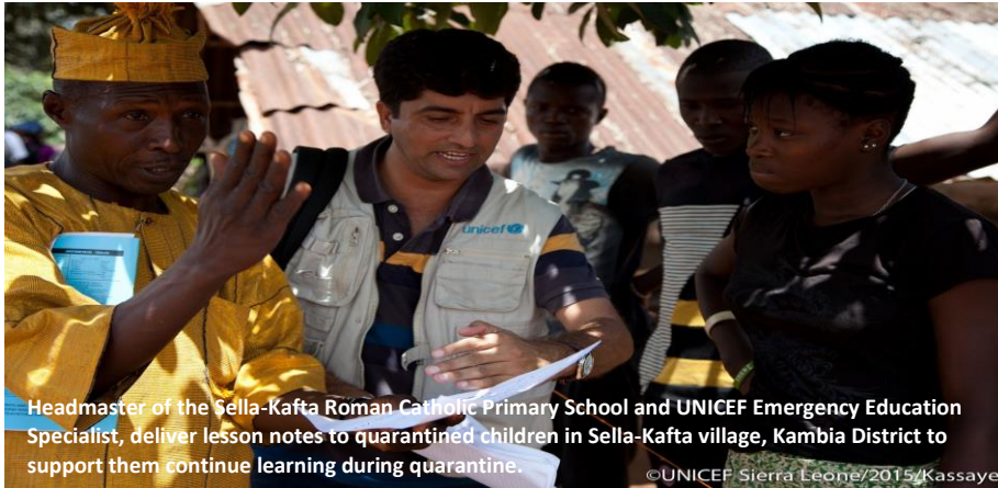
Headmaster of the Sella-Kafta Roman Catholic Primary School and UNICEF Emergency Education Specialist, deliver lesson notes to quarantined children in Sella-Kafta village, Kambia District to support them continue learning during quarantine.