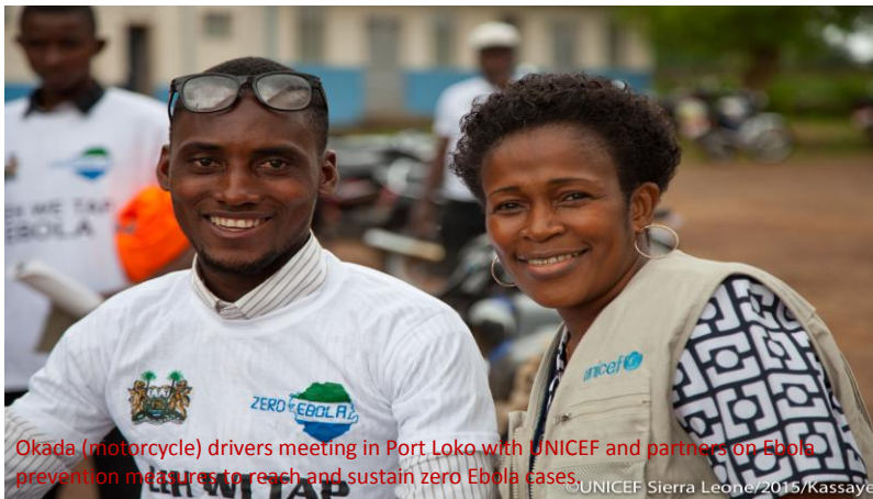
Okada (motorcycle) drivers meeting in Port Loko with UNICEF and partners on Ebola prevention measures to reach and sustain zero Ebola cases.