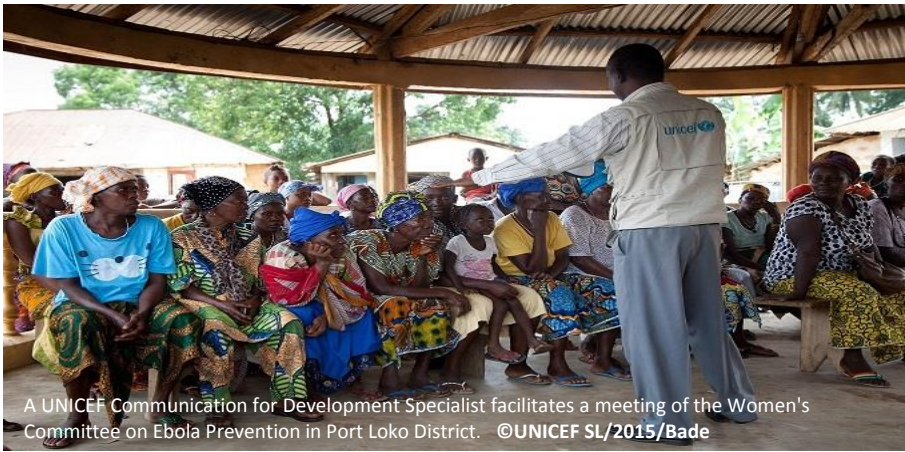
A UNICEF Communication for Development Specialist facilitates a meeting of the Women's Committee on Ebola Prevention in Port Loko District.