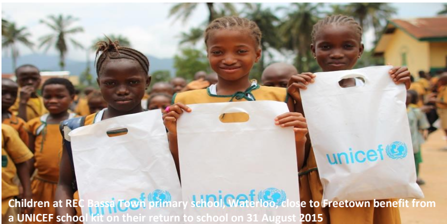
Children at REC Bassa Town primary school, Waterloo, close to Freetown benefit from a UNICEF school kit on their return to school on 31 August 2015