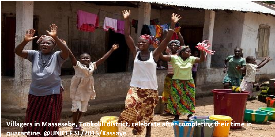
Villagers in Massesebe, Tonkolili district, celebrate after completing their time in quarantine.