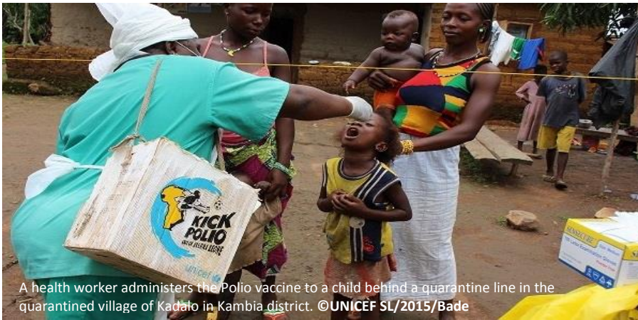
A health worker administers the Polio vaccine to a child behind a quarantine line in the quarantined village of Kadalo in Kambia district.