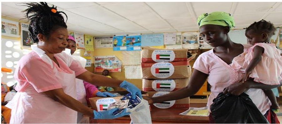
A health worker packs Ready to Use Therapeutic Food for a child at a Community Health Centre in Kambia district