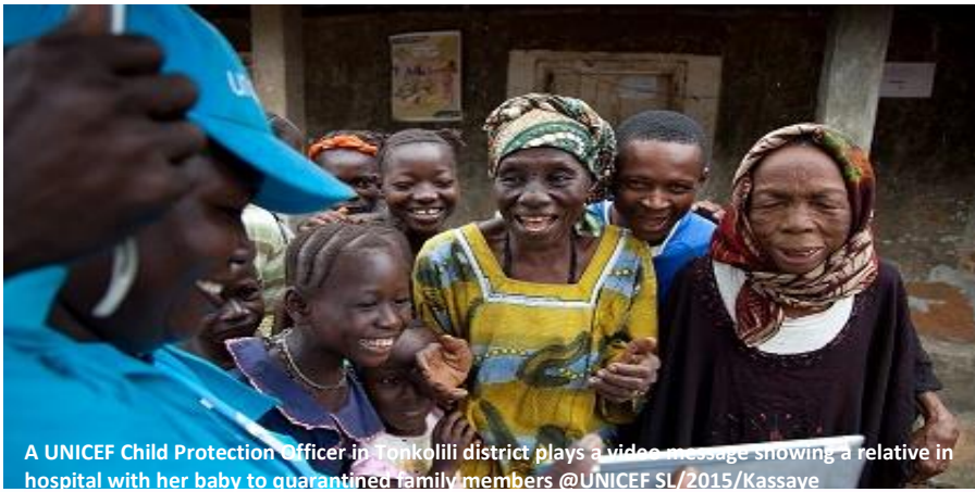
A UNICEF Child Protection Officer in Tonkolili district plays a video message showing a relative in hospital with her baby to quarantined family members