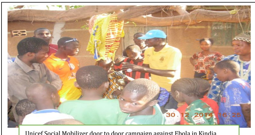
Unicef Social Mobilizer door to door campaign against Ebola in Kindia