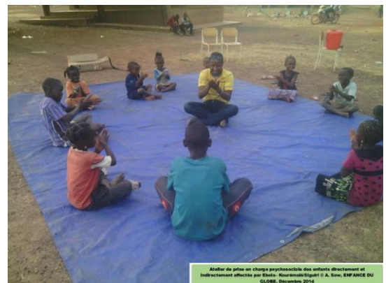
Aideur de prise en charge psychosociale des enfants directement et indirectement affectés par Ebola: Kouroussa (Guinée)