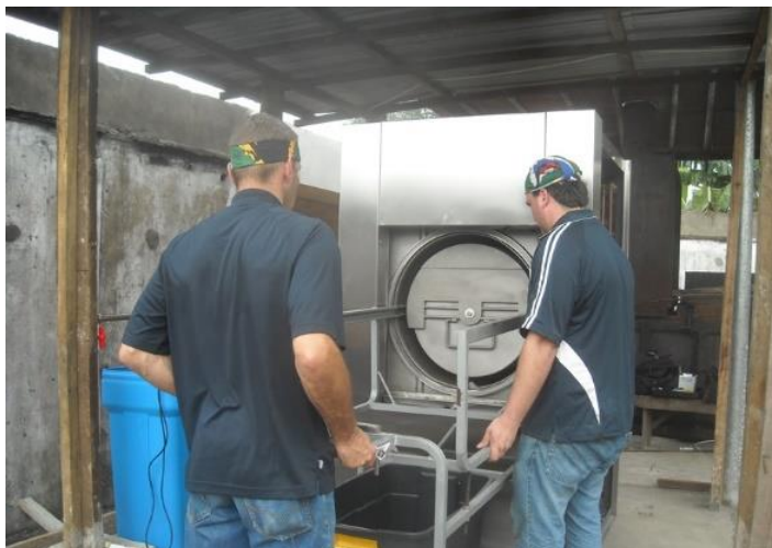
South African technical consultants installing the autoclave at Redemption Hospital, Monrovia. 2 Sept 2015.