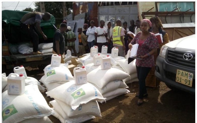
Food distribution conducted by WFP in Conakry, Guinea, in the context of the active research campaign.