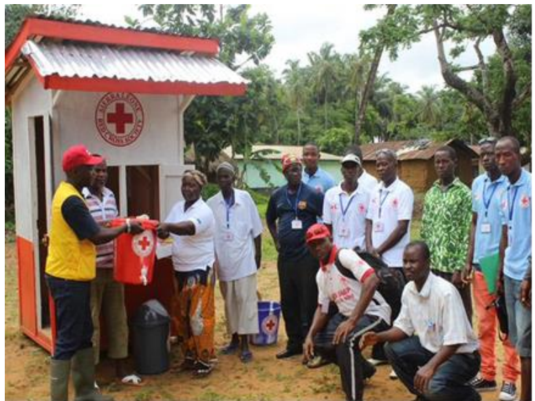
In Port Loko district, the Red Cross intensified community engagement activities through the UNICEF-led Social mobilisation initiative.